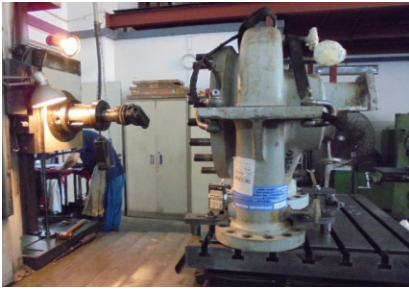
Pump casing concentricity check