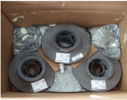
New designed impellers