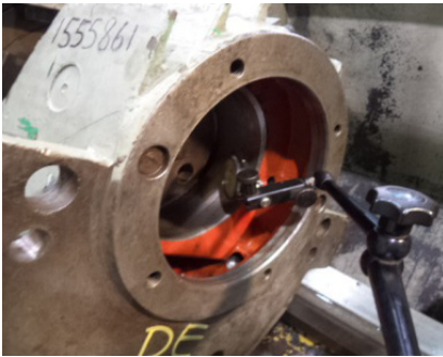
Bearing housing concentricity check