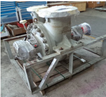
Pump as received from the customer

The platform named Kinabalu A was operated by Shell Malaysia for more than 25 years. The concession expired and the platform was handed over to PETRONAS as an asset owner which subsequently appointed Talisman Malaysia Limited as an operator. Situated at East Malaysia Sabah, production from Kinabalu averaged 7 mboe/d in 2014. In 2015, the company planned to continue progressing the Kinabalu redevelopment project. One of the sanctions that were needed to suit the new requirements was an upgrade of the crude oil transfer pump through Sulzer.