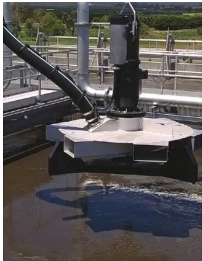
OKI aerator unit being lowered into the bioreactor